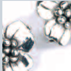
Spirit of Ireland Collection

4 Castle Street, Sligo Tel: 071 9143686 Email: info@thecatandthemoon.com